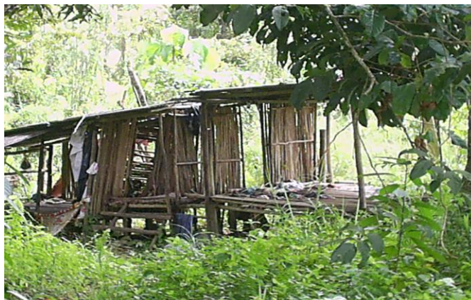
Figure 8: The resting hut used after returning from work

Though rattan and jungle products were the major cash earners for the Orang Kanaq, the people hardly used rattan, except to make brooms and rattan pith (Omar, 1978: 154). The visits to the settlement in 2008 and 2009 found that this situation had not changed. However, one of the inhabitants claimed rattan collection was becoming less attractive to the Orang Kanaq because the collecting area was quite far from their settlement and the rattan plants were diminishing rapidly due to excessive cutting. In 1965, the same issue was highlighted by an official in the Johor Department of Orang Asli Affairs regarding the over dependence of the community on rattan collecting. 27 The Orang Kanaq also made a living by collecting and selling forest produce in addition to fishing and hunting.