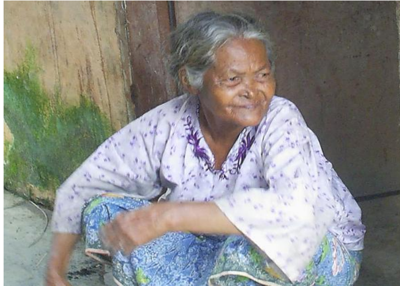
Figure 4: The female shaman

female shaman treating a Chinese and Indian family with charms ( jampi ). The Kanaq seldom visited the neighbouring villages, except to buy groceries from the Chinese, Indian or Indian-Muslim shopkeepers.