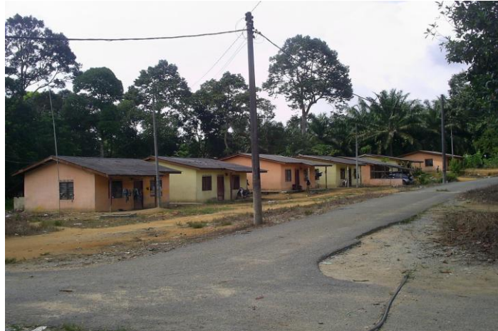
Figure 3: The present settlement in Kampung Sungai Selangi, Mawai Baru

for the Orang Asli. In the case of the Orang Kanaq, requests for such allocations had been forwarded by the Johor Department of Orang Asli officials since 1959, when the Kanaq first moved to Batu 9, Jalan Mawai; by 1964, when they had moved to the present settlement, the issue was still being debated by various authorities responsible for managing the Orang Asli. It was only in 1966 that nine new houses were completed under the Rapid Housing scheme, although a few were lacking proper drainage and latrines (J/T ANI (KT) AAKT.160 Laporan Rancangan Kilat Kampung Selangi, Mawai, Kota Tinggi, 3 February 1966).