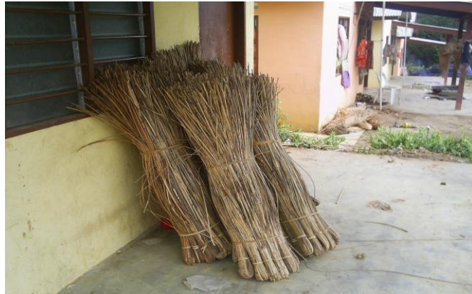
Figure 7: Rattan collected for side income

Though rattan and jungle products were the major cash earners for the Orang Kanaq, the people hardly used rattan, except to make brooms and rattan pith (Omar, 1978: 154). The visits to the settlement in 2008 and 2009 found that this situation had not changed. However, one of the inhabitants claimed rattan collection was becoming less attractive to the Orang Kanaq because the collecting area was quite far from their settlement and the rattan plants were diminishing rapidly due to excessive cutting. In 1965, the same issue was highlighted by an official in the Johor Department of Orang Asli Affairs regarding the over dependence of the community on rattan collecting. 27 The Orang Kanaq also made a living by collecting and selling forest produce in addition to fishing and hunting.