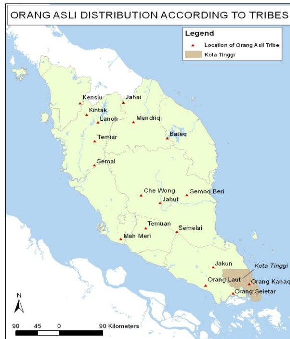
Figure 1: Orang Asli distribution according to tribes