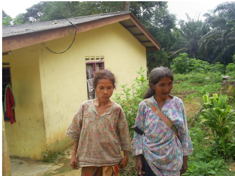
Figure 6: Two elderly women