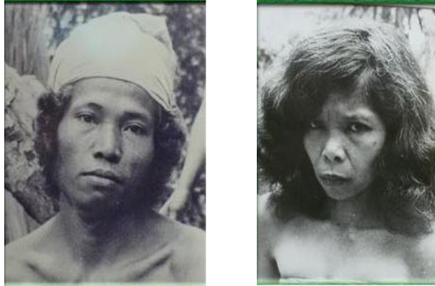
Figure 5: Faces of the Orang Kanaq

Kanaq collected 20 lorries of rattan, which were sold to middlemen (POA. JB 10/10 Pemasaran Hasil Hutan).